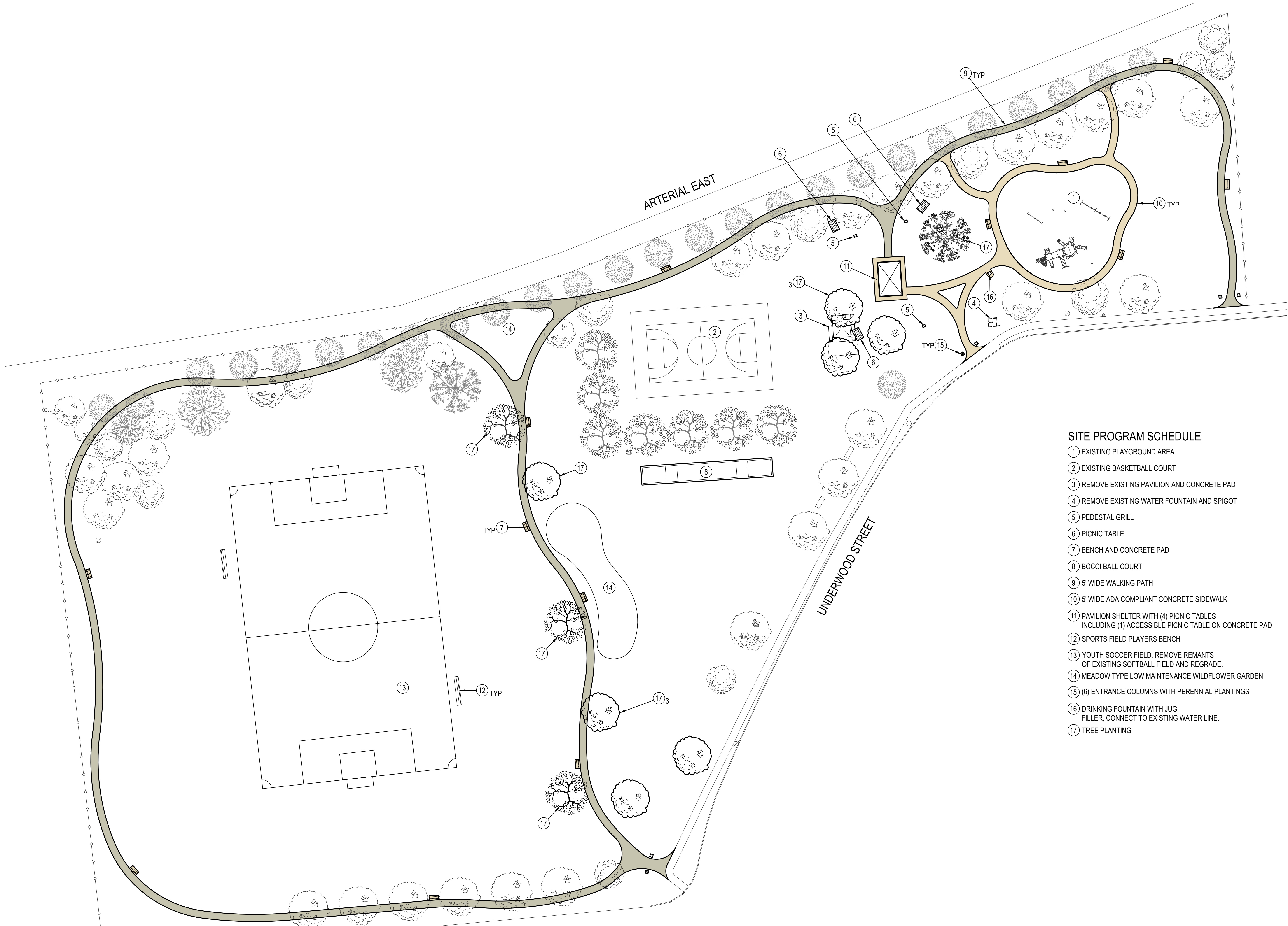
A CONCEPTUAL SITE PLAN SCALE: 1" = 30'-0"