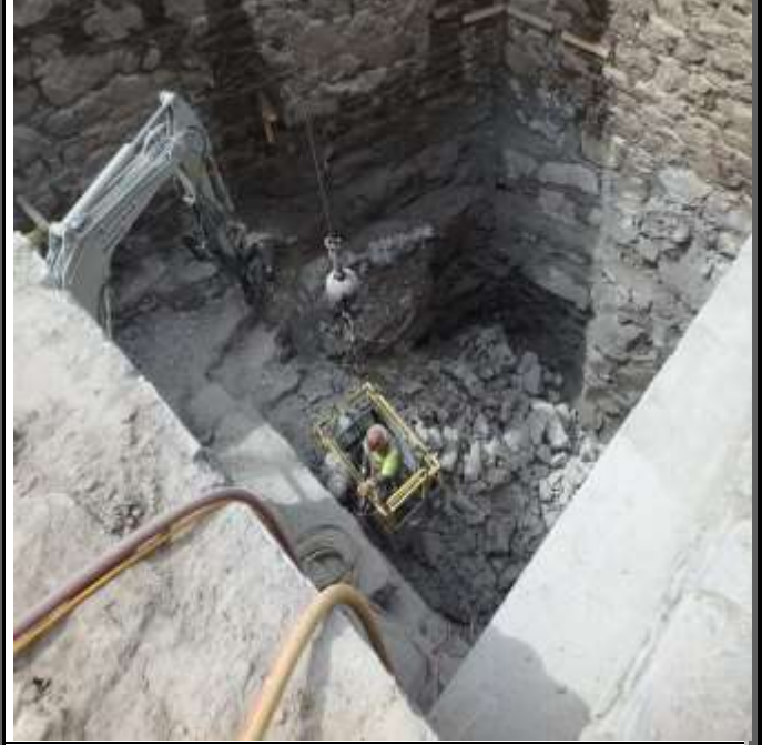
View of the pit as the crew Drills, Splits, and chips. (5-11-17)