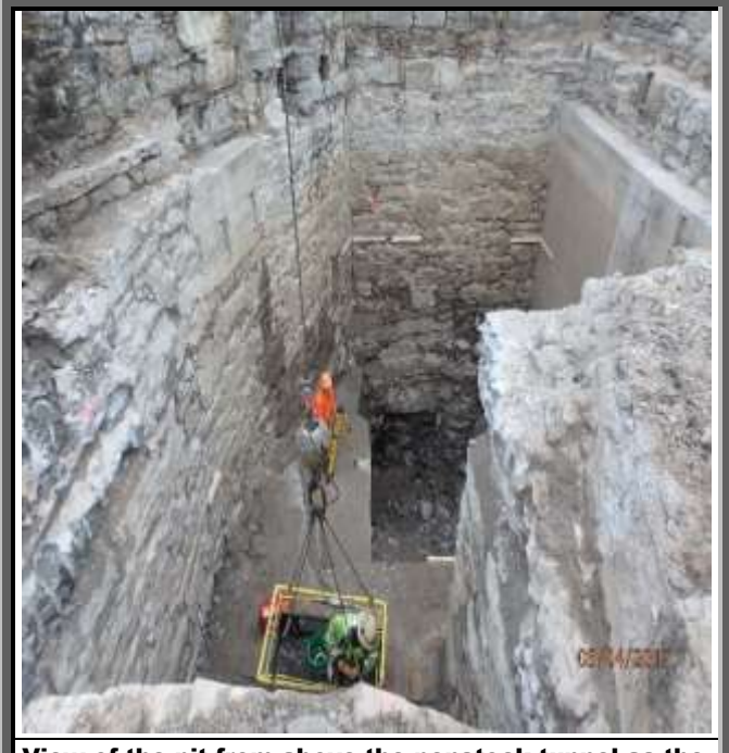
View of the pit from above the penstock tunnel as the crew is surveying and excavating (5-04-17).