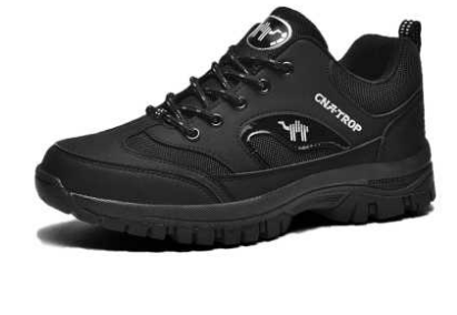
This Will Be a Pair of Shoes Every Man Must Have in 2024!