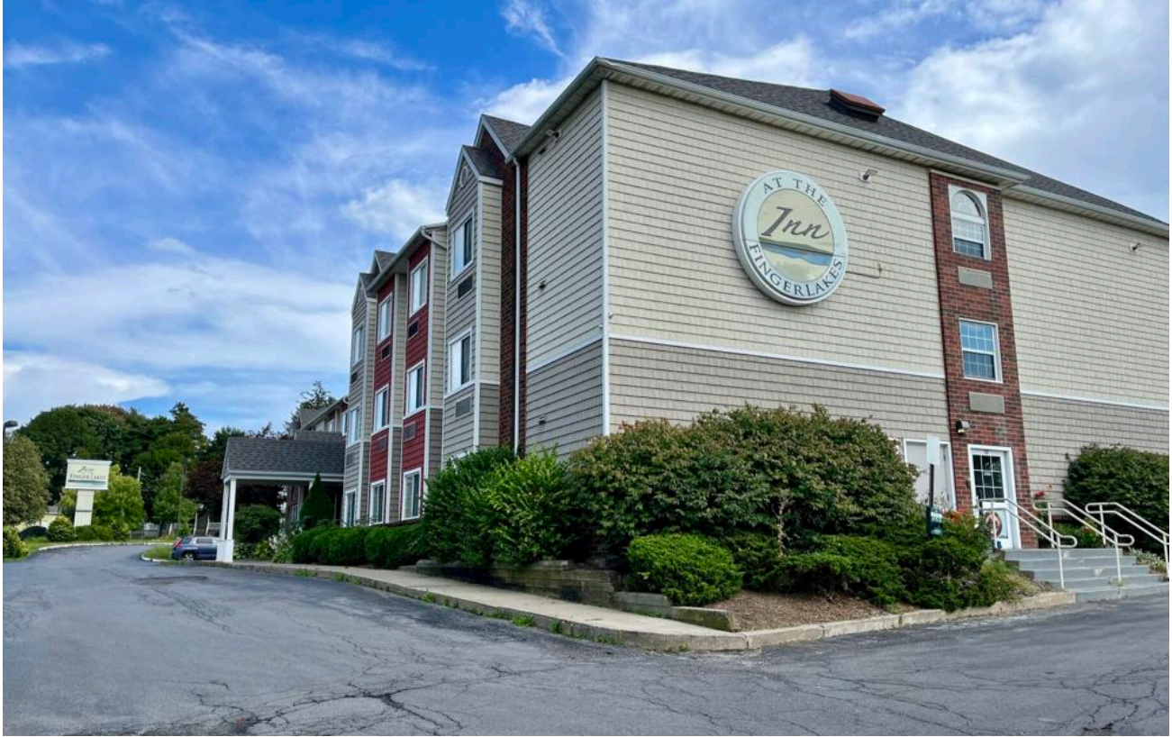
The Inn at the Finger Lakes in Auburn.

The state Legislature approved the measures in June. Before they were delivered to Hochul's desk, the New York State Hospitality and Tourism Association urged her to veto the bills.