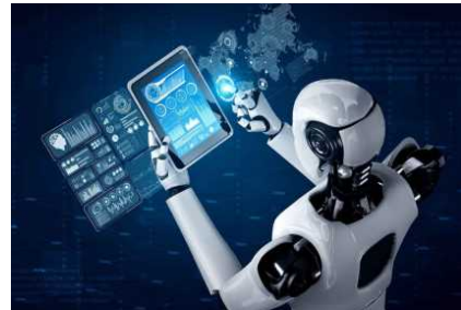
Ai Tech Gear: Tools for Ai Enthusiasts