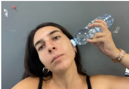
Anyone With Tinnitus (Ringing Ears) Should See This - They Hide This From You