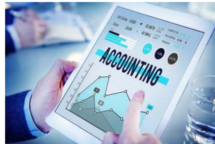
Techledgers: Streamline Finances With Accounting Software