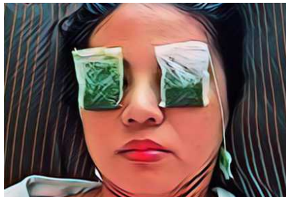
How People Over 50 Fix Their Blurry Vision Back to 20/20