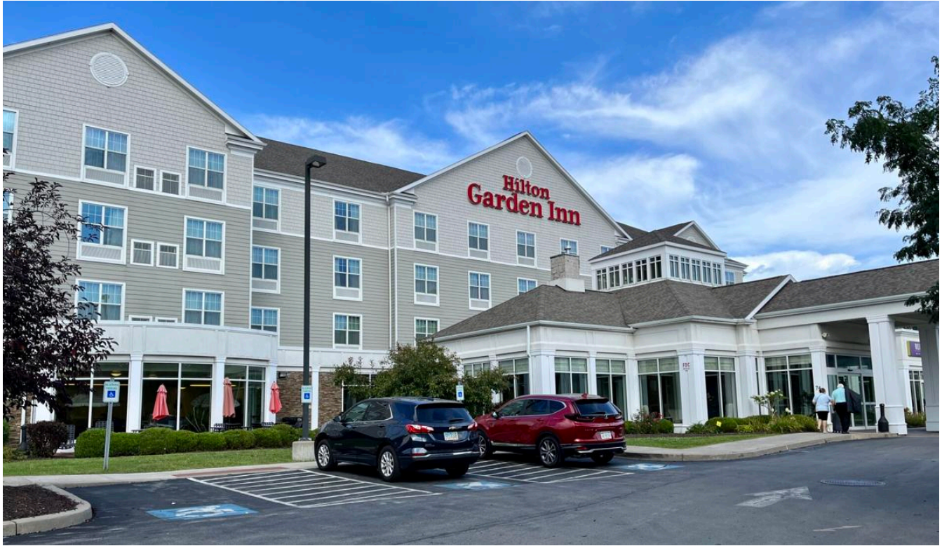
The Hilton Garden Inn in Auburn. The city may pursue a hotel tax, similar the one approved for the village of Weedsport, that would be in addition to other taxes, including the county's occupancy tax.