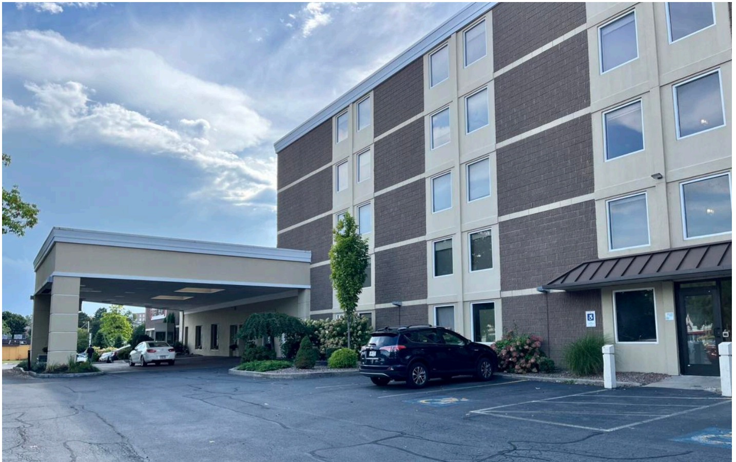
The Holiday Inn in Auburn.