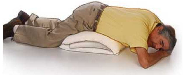
Urologist: Swollen Prostate? Do This Immediately