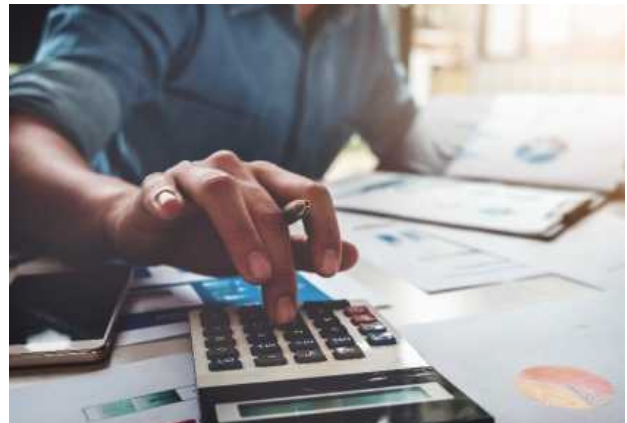
Accounting: More Than Just Crunching Numbers