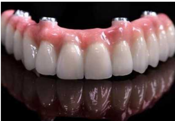
This is What Full Mouth dental implants should Cost You in 2024