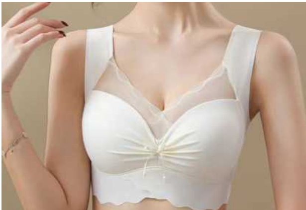
A 70-year-old Engineer Designed This Bra for Elderly Women All Over the World