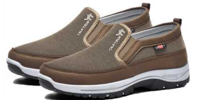
This Will Be a Pair of Shoes Every Man Must Have in 2024!