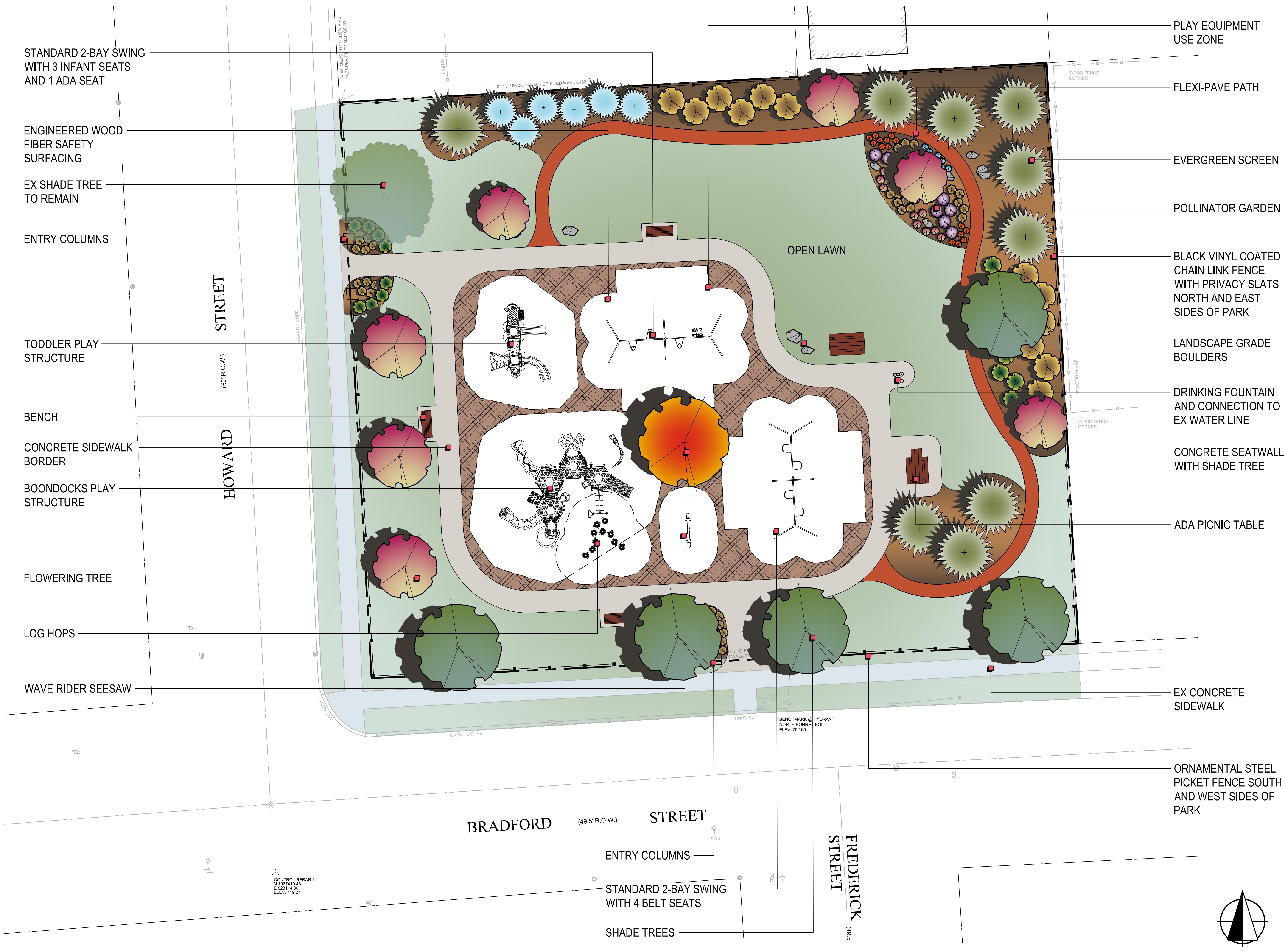
BRADFORD STREET MASTER PLAN SCALE: 1" = 10'-0"